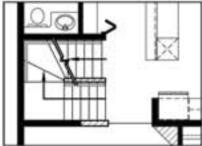
Main floor - Alternative #1