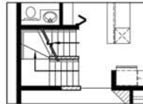
Main floor - Alternative #1